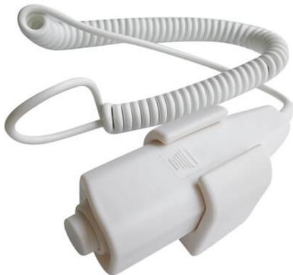
Picture of Hand switch L04