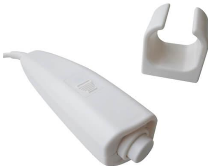
Picture of Handle and cradle

Weifang Newheek Medical Image Equipment Co., Ltd.