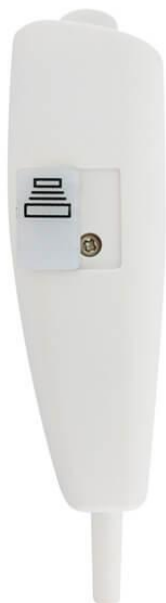
Picture of Handle